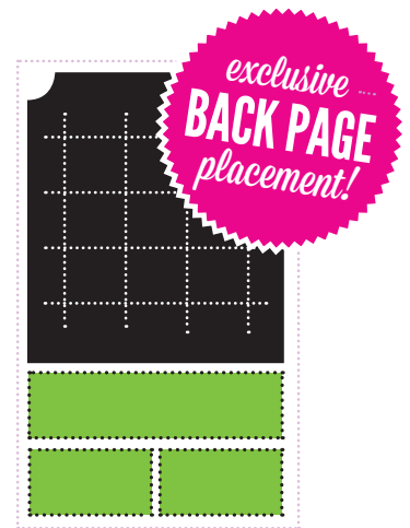
"The Back Page Feature"