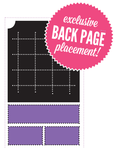
"The Back Page Feature"

$760 /issue $680 /each, when 2 or more ads booked $600 /each, when 7 ads booked